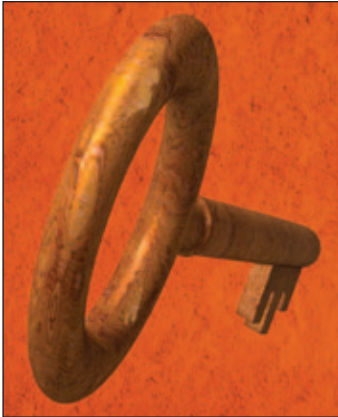
Logic: The key to all learning

The most immediate benefit derived from the study of logic is the skill needed to construct sound arguments of one's own and to evaluate the arguments of others. In accomplishing this goal, logic instills a sensitivity for the formal component in language, a thorough command of which is indispensable to clear, effective, and meaningful communication. On a broader scale, by focusing attention on the requirement for reasons or evidence to support our views, logic provides a fundamental defense against the prejudiced and uncivilized attitudes that threaten the foundations of our democratic society. Finally, through its attention to inconsistency as a fatal flaw in any theory or point of view, logic proves a useful device in disclosing ill-conceived policies in the political sphere and, ultimately, in distinguishing the rational from the irrational, the sane from the insane. This book is written with the aim of securing these benefits.